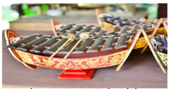
...taken part in a musical workshop experience from a different culture to our own.