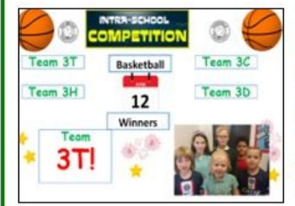
...participated in an intra-school competition.