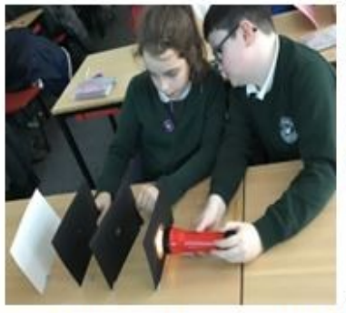
... prepared a three course meal, ... carried out fun, practical scientific investigations.