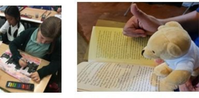
...invited our parents in to enjoy a shared reading experience.