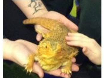
...had hands on experience with a range of different animals.