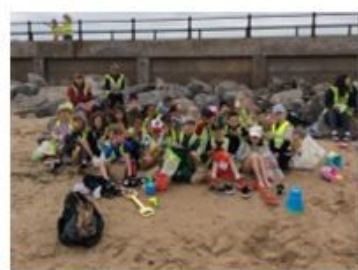
...visited the seaside.