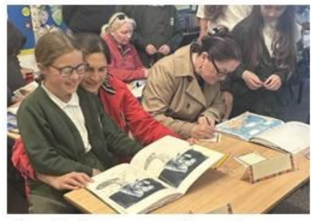
... invited our parents and carers to engage with our learning.