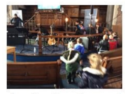
...shared in other cultures and explored their beliefs, traditions and ideas.