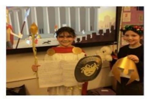
...made a creative project and presented it to an audience.