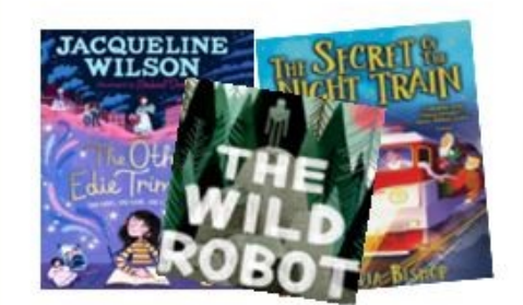
...read three exciting new novels with my teacher.