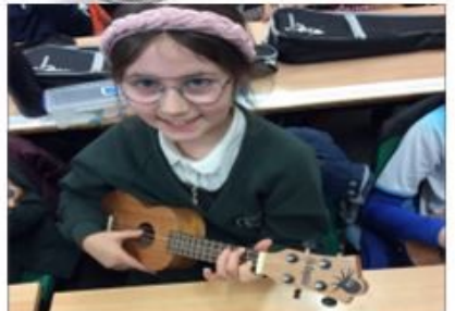
...learned to play a musical instrument ...