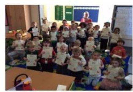
...an understanding of mindfulness and respect for others through peer massage.