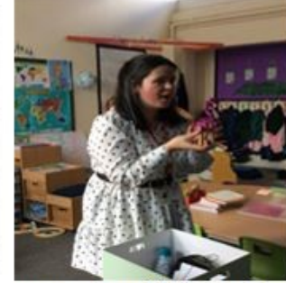
...met a real life artist and created wire art in her style.