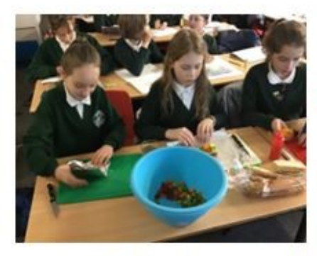
researching farm to fork.