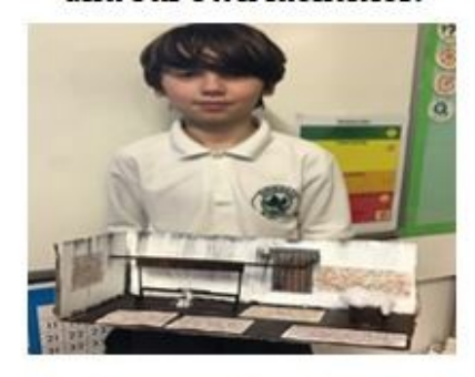
... made a creative project and presented it to an audience.