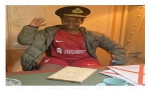
... visited a World War Two bunker (Western Approaches) and learnt about the lives of the workers.