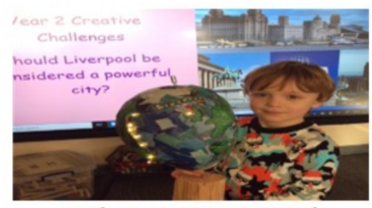
...made a creative project and presented it to an audience.