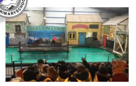
...experienced a school trip to Knowsley Safari Park.