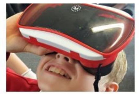
... taken part in a Space Virtual Reality workshop.