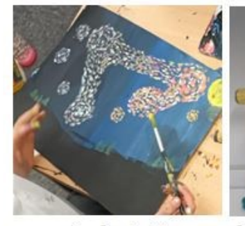
... presented paintings and sculptures in an art exhibition for parents.