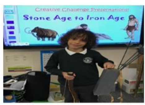
...made a creative project and presented it to an audience.