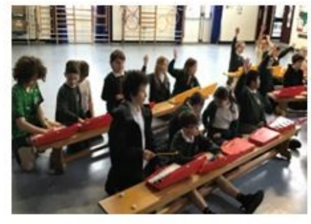
...taken part in a music workshop linked to Black History