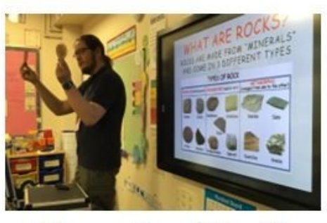
...taken part in an interactive science workshop