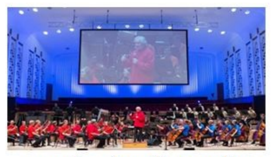
...experienced a performance from a live orchestra in a theatre.