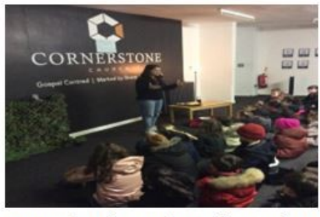
Visited a place of worship to learn more about what people believe.