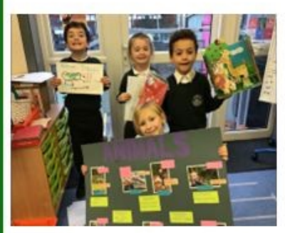
...made a creative project and presented it to an audience.