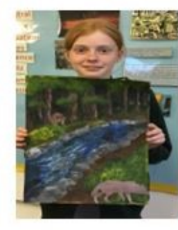
.. showcased our learning and celebrated all our achievements at the Leavers' Ball.