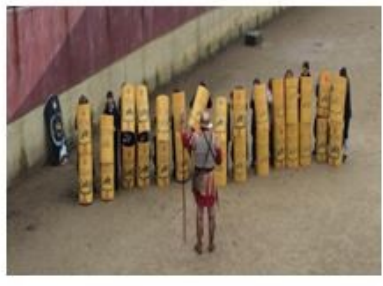
...experienced life as a Roman in Chester.