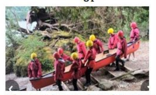
..taken part in an active, adventurous team-building residential.