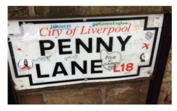
...carried out geographical fieldwork.