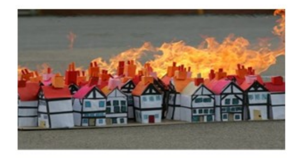
...set up and experienced our own Great Fire of London.