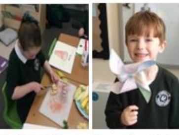
...designed, made and evaluated a moving greetings card, fruit pot and toy windmill.