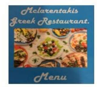
...become a food critic, tasting food from Greece.